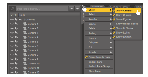
Figure 13: Filtering out cameras in the Scene pane.