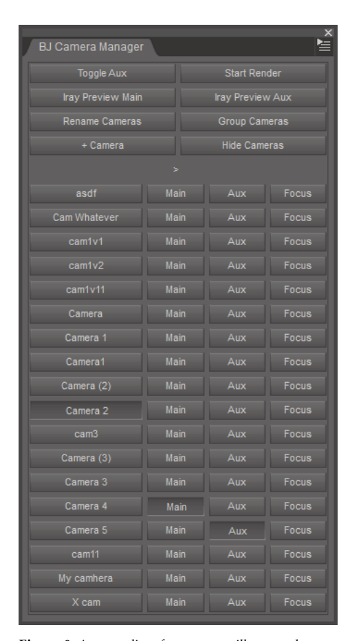
Figure 9 : A messy list of cameras to illustrate the sorting algorithm.