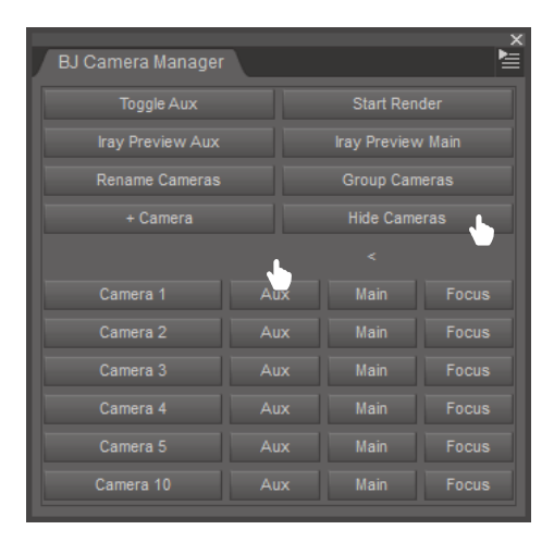
Figure 8 : The Hide Cameras button and Main/Aux Swap button. Main and Aux columns have been swapped here, which also swaps the Iray Preview buttons at the top.