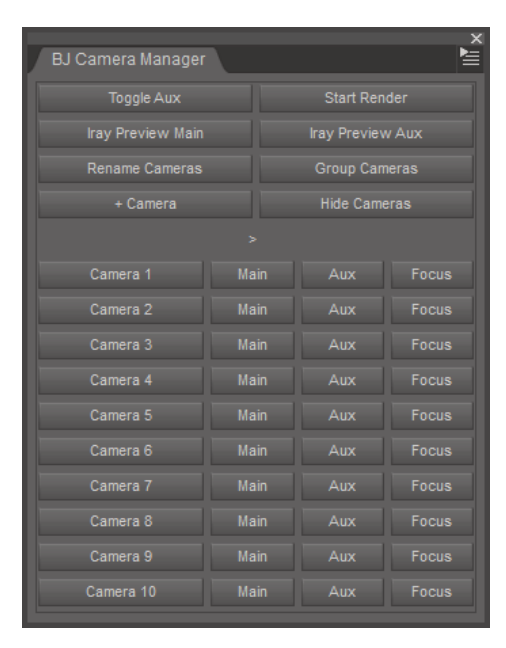
Figure 1: Overview of the plugin.