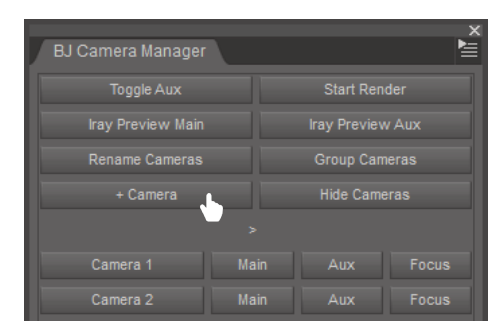
Figure 7: Add a new camera to the scene based on Perspective View.