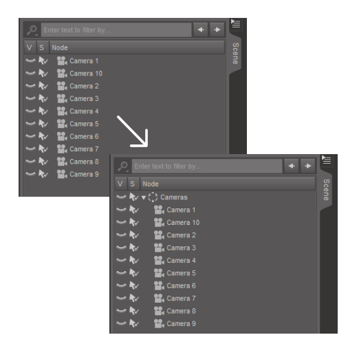
Figure 6: Cameras have been grouped.