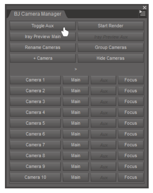
Figure 2 : Aux Pane toggled off results in related buttons being disabled.