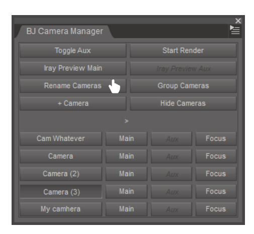
Figure 5 : The Rename Camera button gives you a quick rename of all cameras in the scene.

somewhere at a reasonable size, especially if you have multiple monitors, you will surely love this improved workflow.