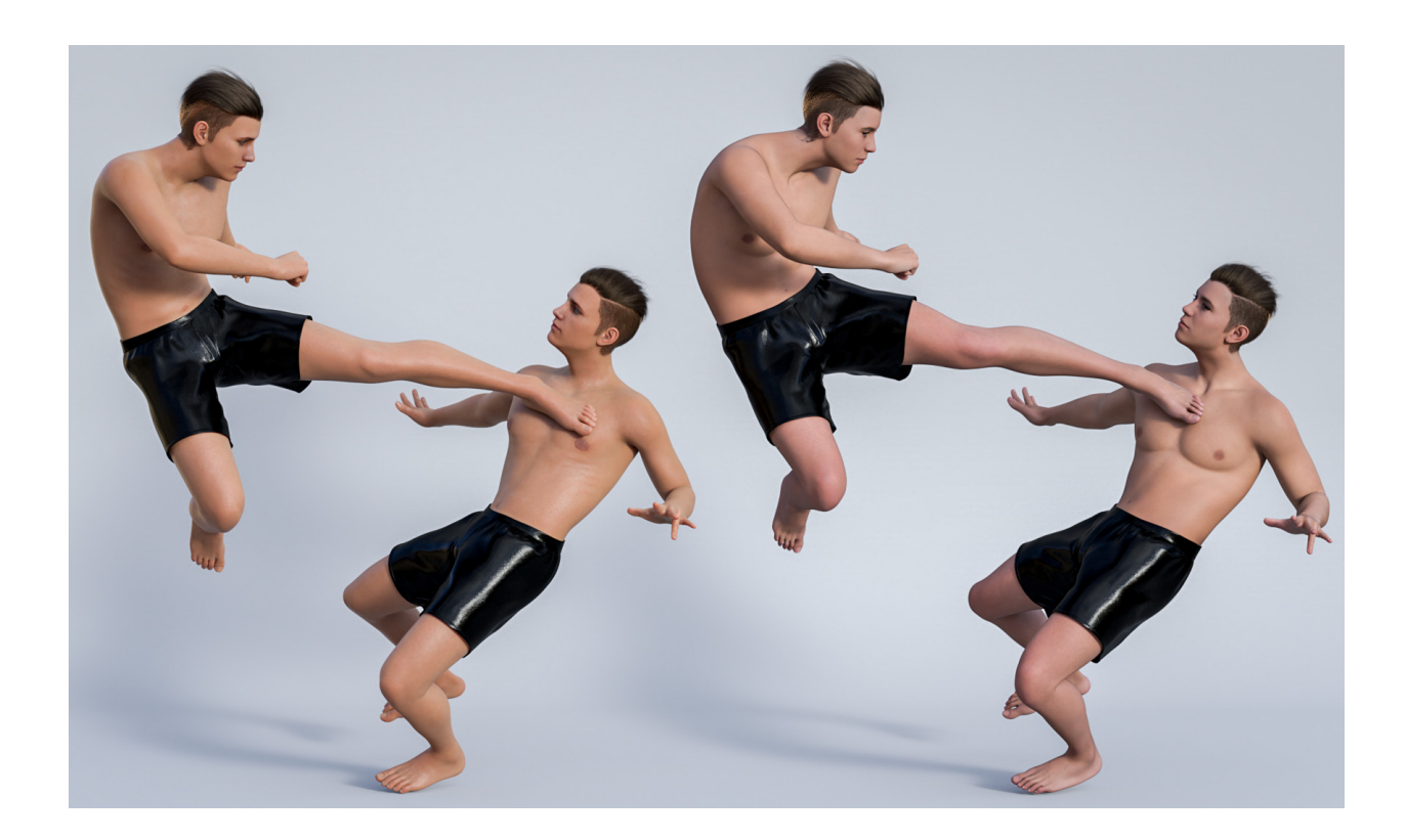
Figure 1: Conversion results: Genesis 8 on the left, Genesis 9 on the right.