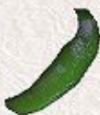
ingenmame = haricot bean