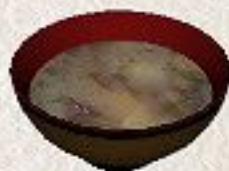
misoshiru_owan = miso soup_wooden bowl