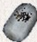
kome_meshi = rice_boiled rice (rice ball)