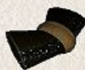
kobumaki = sea tangle roll