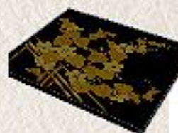
bentou_huta = lunchi box_lid