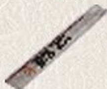
hashi_hukuro = chopsticks_cover