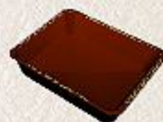
kome_sara = rice_plate