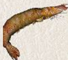
ebiten = tempura of shrimp