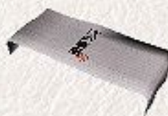
bentou_huta_kami = lunchi box_lid_paper