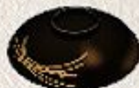
owan_huta = wooden bowl_lid