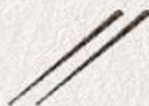
hashi_1 and 2 = chopstick(s)