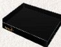
bentou_hako = lunchi box_box

My Bento (lunch box) might be more rich. Please enjoy with miso soup!